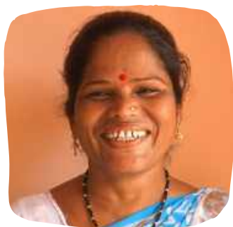
BHARATI DABHANE SCHOOL SUPPORT STAFF